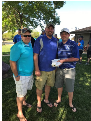
Golf Tournament Top Four Teams 2nd Place Winchester