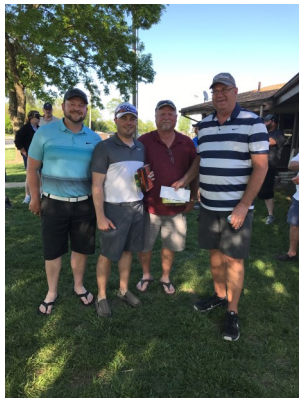
1st Place Bremen