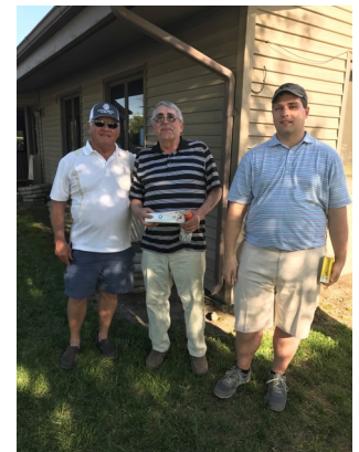
4th Place St. Luke #3 Manhattan