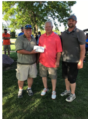
3rd Place Nortonville #1