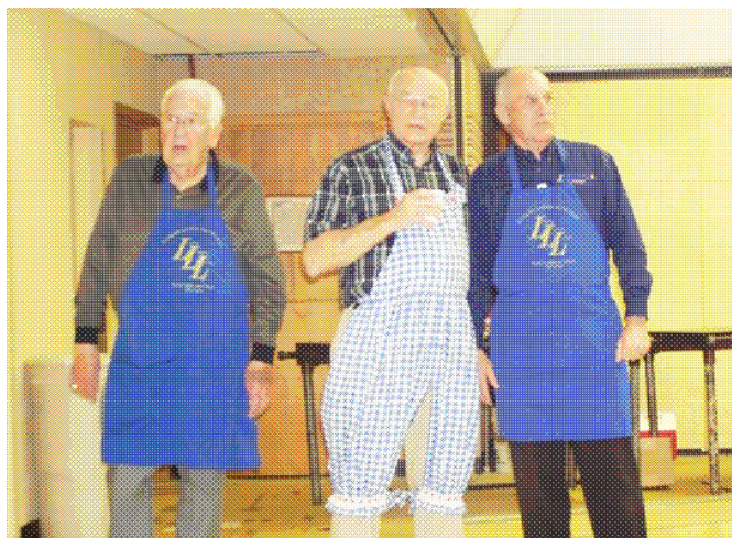
Trinity Salina Pancake Feed Aren't they cute?

Zone 12 Trinity Salina 56th Annual On Sunday, from 4 to 7 p.m. January 27th, the Trinity Lutheran Laymen's League served 600 people to raise $2,500 for the District Project. The event, sponsored by the Trinity LLL, received help from the Trinity Youth Group, serving sausage and pancakes with about 40 Trinity LLL members. The two groups went home happy for the time spent together in ser-